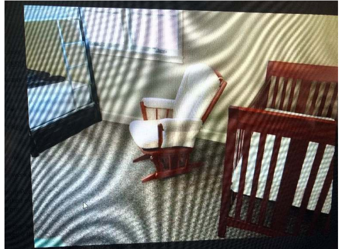
A special gift from the Eshoff family, going to a new, good home.