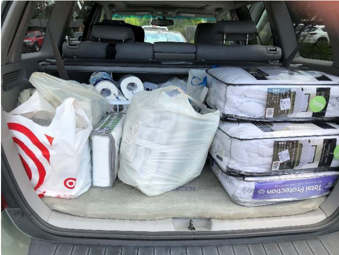
A trunk full of everything needed to set up a bedroom and bath.

Gilead House – PCN bedroom refurnished. This past summer a new mother moved into the bedroom that PCN sponsored through an anonymous donation, so many years ago when GH was being built. Through our local youth mission trip and your mission dollars, the room was thoroughly cleaned, all supplies for the bedroom and full bath were bought, and the room refurnished. The young woman and her one-year-old son are extremely grateful for their new stable home, the first they have ever had together. Below are photos from the event: