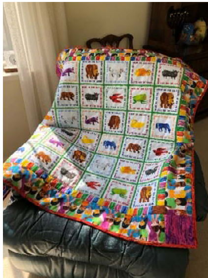
Another special gift, a handmade quilt for the baby.