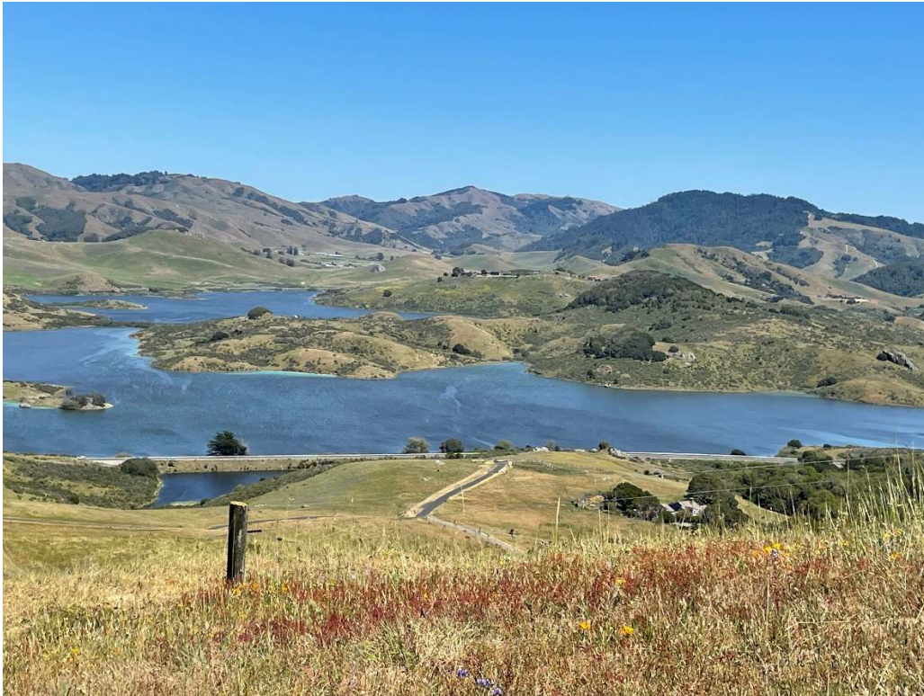
Only in Marin ...