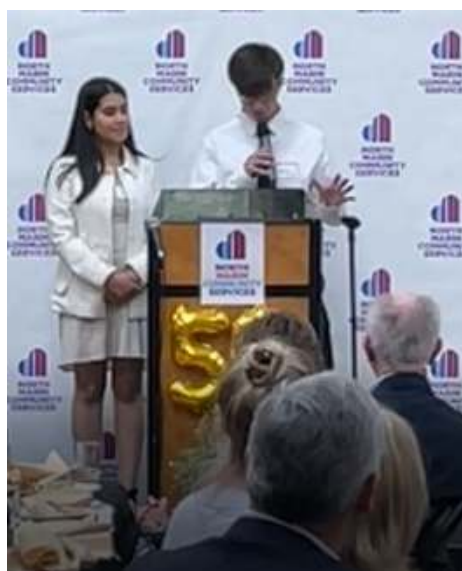
Teen board members from SMHS & NHS