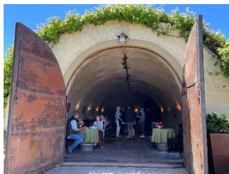
The wine cave