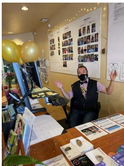
A warm welcome

Fifty years and going strong, having been given the Heart of Marin Non-Profit Excellence Award for 2021, there was a lot to celebrate at April's thank-you lunch.