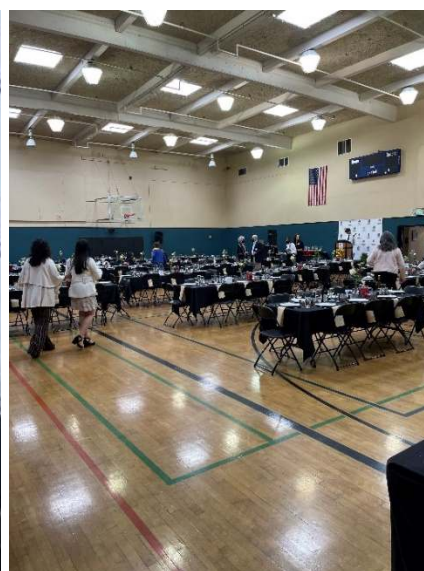
Awaiting a gym full of well-wishers