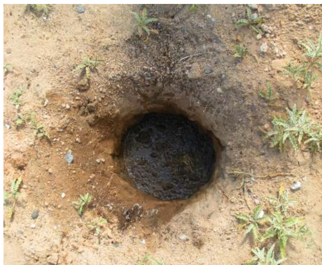
One of the 300 holes dug, prepared and watered to get a deep-water start for planting a young tree