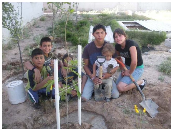
Pecan planted with PVC pipe to support the young pecan tree and to enable deep watering as it grows