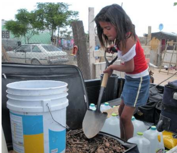
Unloading the materials to enrich the Juarez soil