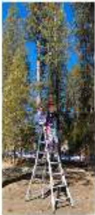
HUME LAKE 2020 MIDDLE SCHOOL