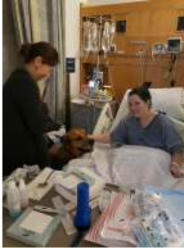
Me and Twinkie, a therapy dog

I want to start off by saying a huge “THANK YOU!” to each and every person at PCN. I have never felt such love and support from so many people during my time in the hospital and in recovering afterwards. I had one of the most severe cases of mono the doctors had seen and, in addition, had tonsillitis and a super-imposed bacterial infection on my larynx. This caused me to lose the ability to swallow anything but my own saliva, I was unable to speak very well and was kept in the hospital for about two weeks until I could safely return home.